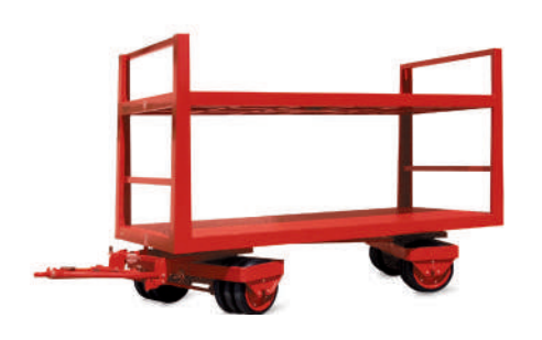
MOD. 43 - RRV - Double loading platform