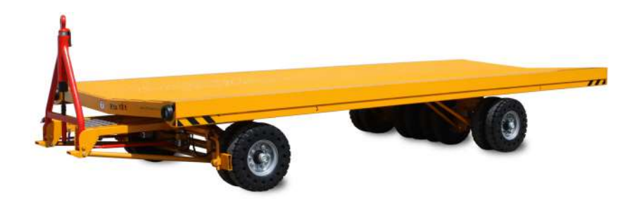
MOD. 43 - RRISE - "V" loading platform