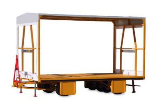
MOD. 43 - RISE - With full suspension