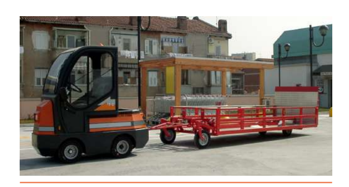
MOD. 18 - S - For shopping trolleys